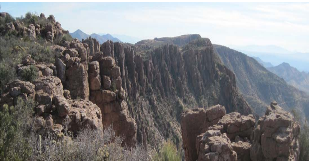
Looking south from the top of Apache Leap