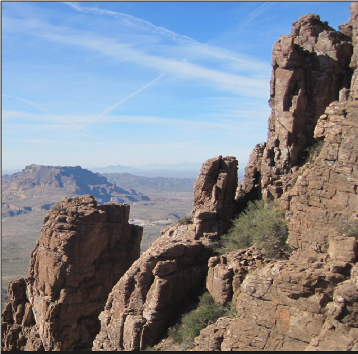
A view of Picketpost Mountain from the top of Apache Leap